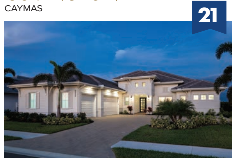
STOCK LUXURY HOMES 9550 Moonflower Lane, Naples, FL 34113 Base Price: $2,917,814