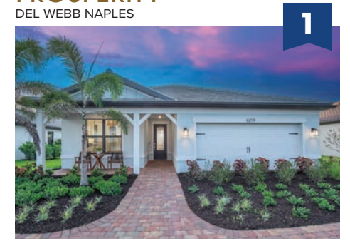
DEL WEBB 6219 Liberty Street, Ave Maria, FL 34142

Base Price: $429,990 Retail Price: $570,406