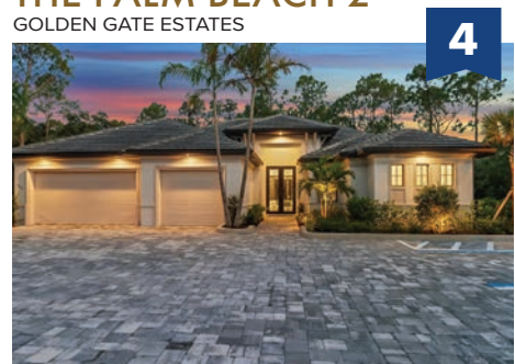
FREY & SON HOMES INC

4472 Pine Ridge Rd, Naples, FL 34116 Base Price: $1,670,000 Retail Price: $1,899,900