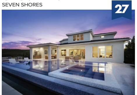
TOLL BROTHERS 8876 Oceana Way, Naples, FL 34114 Base Price: $1,233,995