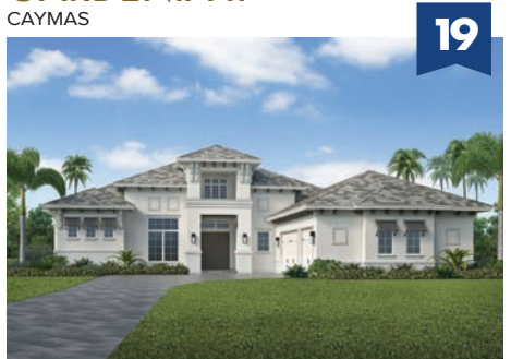
STOCK LUXURY HOMES 9578 Caymas Way, Naples, FL 34113 Base Price: $3,608,745