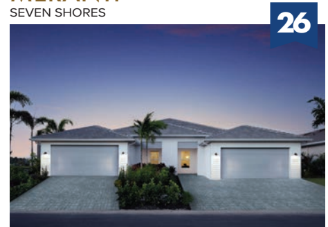
TOLL BROTHERS 8876 Oceana Way, Naples, FL 34114 Base Price : $570,995