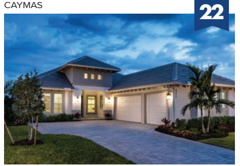
STOCK LUXURY HOMES 9377 Caymas Terrace, Naples, FL 34113 Base Price: $2,271,510