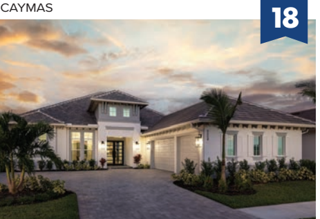
FEATURED MODEL STOCK LUXURY HOMES 9554 Moonflower Lane, Naples, FL 34113 Base Price: $2,828,575