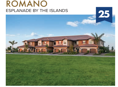
TAYLOR MORRISON 15256 Zeno Way Unit 204, Naples, FL 34114 Base Price: $642,136