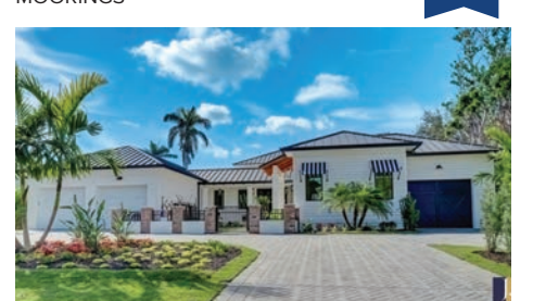
J. SWEET CONSTRUCTION

424 Spinnaker Drive, Naples, FL 34102 Base Price: $9,950,000 Retail Price: $10,200,000