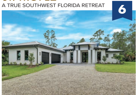
KAYE LIFESTYLE HOMES

933 11th ST SW, Naples, FL 34117 Base Price: $2,099,900